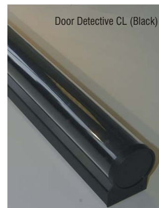
Door Detective CL (Black)

For further information please contact your local dealer or the manufacturer