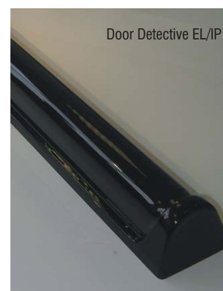
Door Detective EL/IP